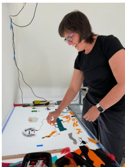
Working on “35 Days” (2025) on a light table.

Her film, “Swallowed Whole,” about breaking her back, screened in over 25 film international film festivals and was awarded “Best Experimental Film” at the Seoul International Extremely Short Film Festival, Female Eye and Big Muddy Film Festivals, and Humboldt International Film Festival. The publication, “Heidi Kumao: Real and Imagined” (2022), documents her solo exhibition of narrative fabric works and animations and received a Gold Award from the Midwest Book Awards.